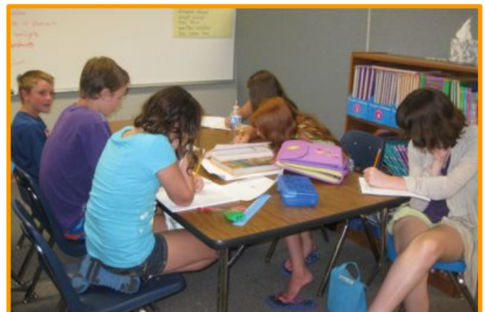
Students in last year's Writers' Workshop