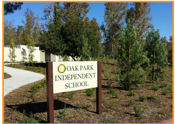
A home of our own!